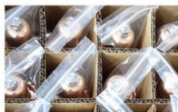
Plastic bag for single part with customized package