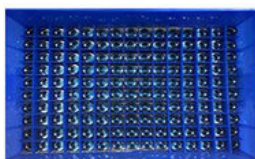
Use plastic box and and partitions to pack them

For fragile or heavy products, we customize reasonable and safe packaging methods according to needs