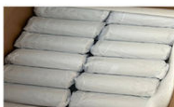
Packed by using paper