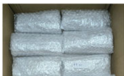
Using bubble bag to pack