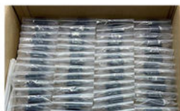
Plastic bag one by one