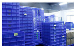
Pack in plastic box