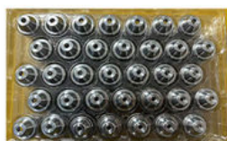
Blister box to pack