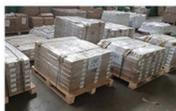
Use pallet to stack the goods