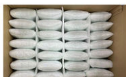
Packed with foam