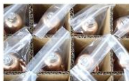
Plastic bag for single part with customized package