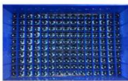
Use plastic box and and partitions to pack them

For fragile or heavy products, we customize reasonable and safe packaging methods according to needs