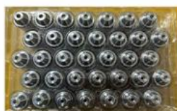
Blister box to pack