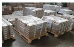
Use pallet to stack the goods