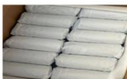
Packed by using paper