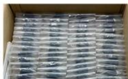
Plastic bag one by one