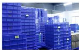
Pack in plastic box