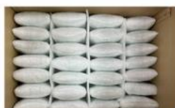
Packed with foam