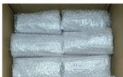
Using bubble bag to pack