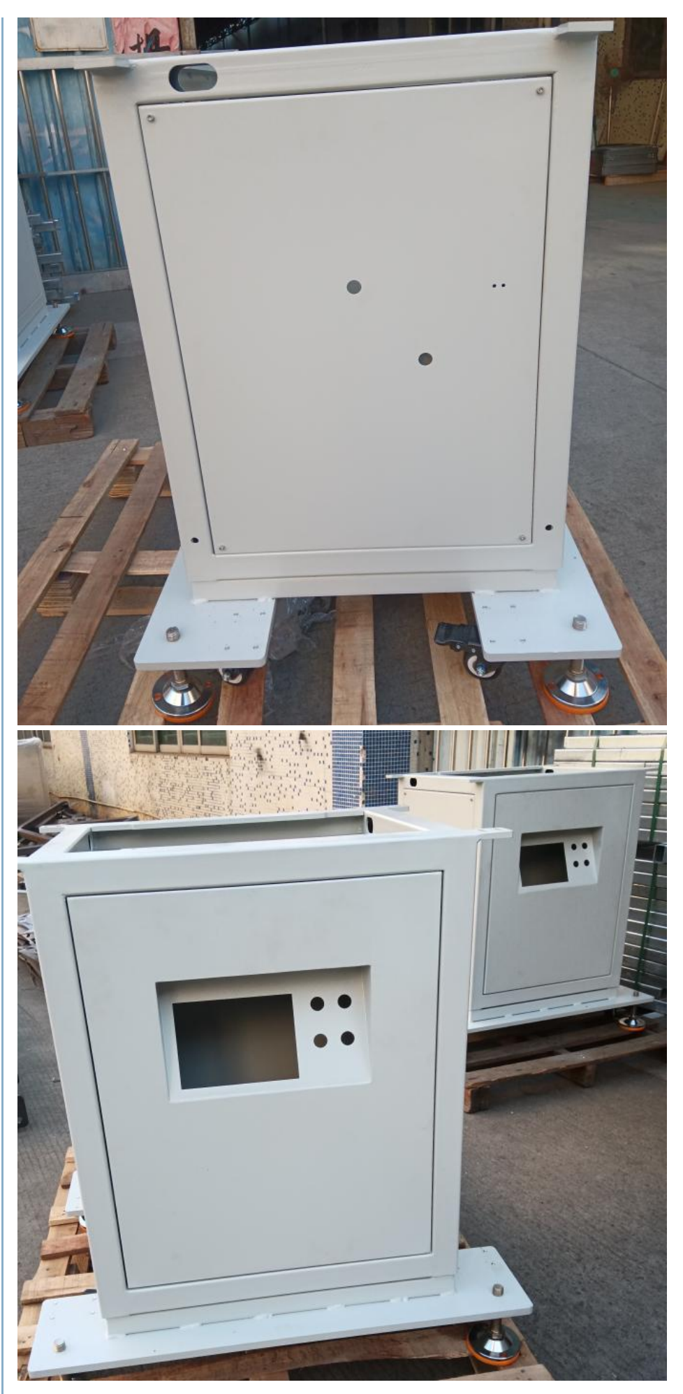
Key word: stamping steel parts auto stamping parts sheet metal stamping parts metal parts stamping stamping sheet metal parts aluminum stamping parts