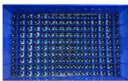
Use plastic box and and partitions to pack them

For fragile or heavy products, we customize reasonable and safe packaging methods according to needs