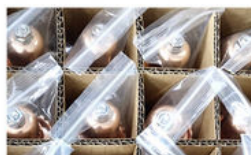
Plastic bag for single part with customized package