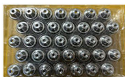
Blister box to pack