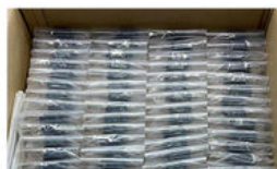
Plastic bag one by one