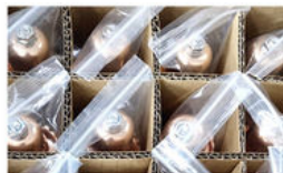
Plastic bag for single part with customized package