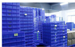
Pack in plastic box