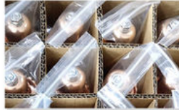
Plastic bag for single part with customized package