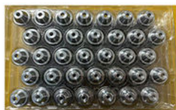
Blister box to pack