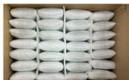
Packed with foam