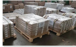
Use pallet to stack the goods