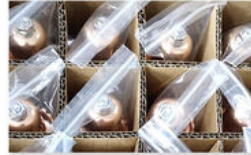
Plastic bag for single part with customized package