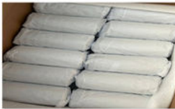
Packed by using paper