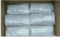
Using bubble bag to pack