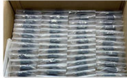
Plastic bag one by one