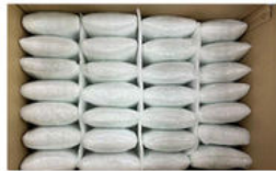
Packed with foam