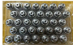
Blister box to pack