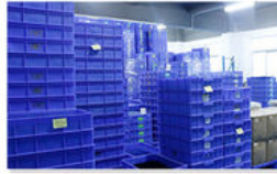
Pack in plastic box