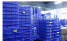
Pack in plastic box