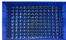
Use plastic box and partitions to pack them

For fragile or heavy products, we customize reasonable and safe packaging methods according to needs