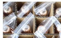
Plastic bag for single part with customized package