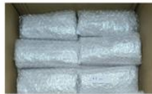
Using bubble bag to pack