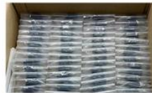
Plastic bag one by one