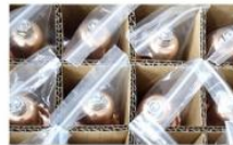
Plastic bag for single part with customized package