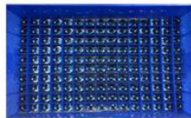
Use plastic box and partitions to pack them

For fragile or heavy products, we customize reasonable and safe packaging methods according to needs