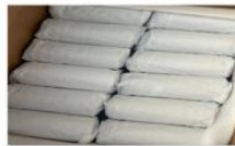
Packed by using paper