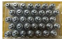
Blister box to pack