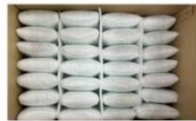
Packed with foam