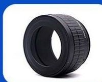
Anodized Sandblasting 200#