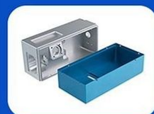
Anodized Sandblasting 200#