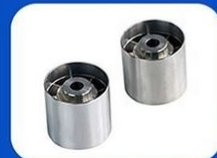
Die Casting + CNC machining