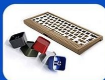
Sandblasted Color Oxide 180#