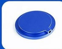
Oxidation Sandblasting 150#