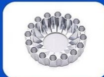
No Surface Treatment