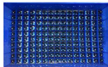
Use plastic box and partitions to pack them

For fragile or heavy products, we customize reasonable and safe packaging methods according to needs