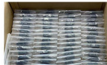
Plastic bag one by one