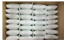
Packed with foam