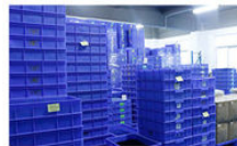
Pack in plastic box