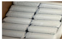
Packed by using paper