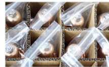
Plastic bag for single part with customized package